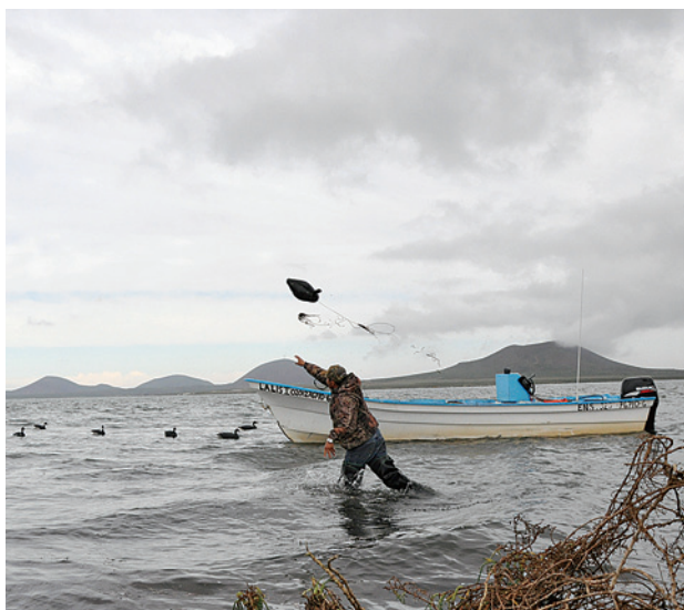
The Bay in San Quintín, Baja California, Mexico, harbors dense eelgrass shielded by volcanic cones, making it prime winter brant habitat.