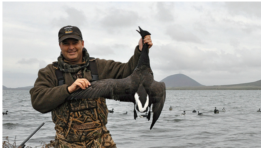
The group limited out with 10 brant apiece, all reluctantly retrieved by Carson, a 2-year-old yellow Lab.